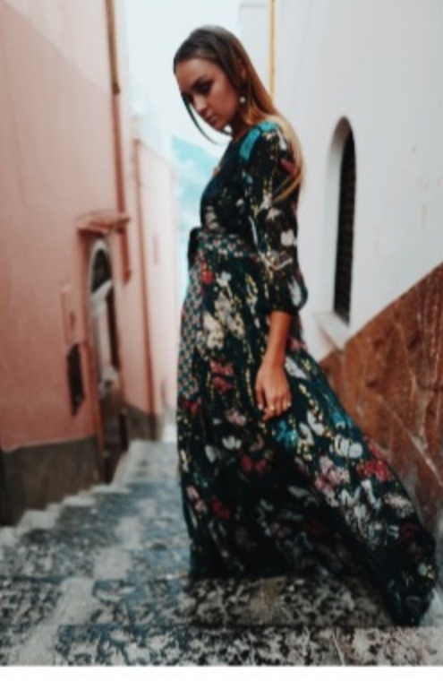
VIA MARINA GRANDE, POSITANO 9. JUNI 2017