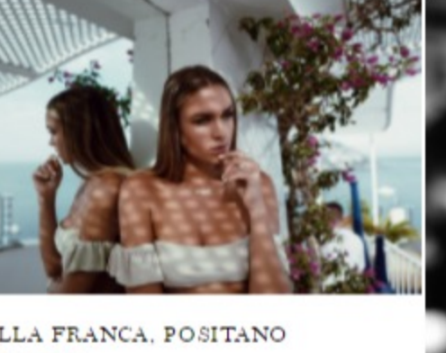
VILLA FRANCA, POSITANO 6. JUNI 2017