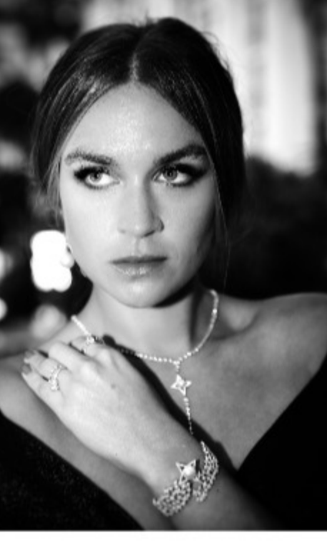
CANNES FILM FESTIVAL 30. MAI 2017