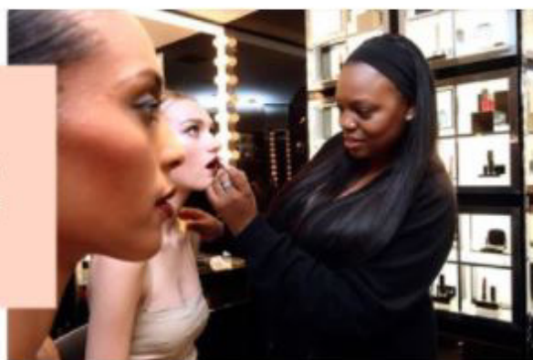
Pat McGrath Labs

"I am extraordinarily passionate about lifting up muses who do not embrace standard ideals of beauty."